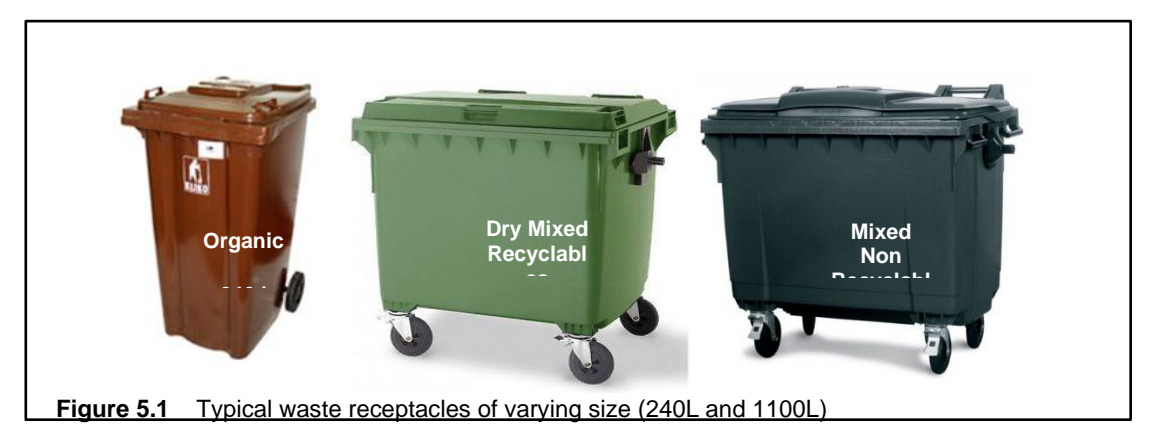
The Epac compactor referred to in the list of bins/equipment in the residential basement WSA is a compactor that compresses/compacts the waste into 2m³ and 3m³ skip bags (also called Flexible Intermediate Bulk Containers or FIBCs). A photo of the

Epac mini compactor is provided as Figure 5.2.